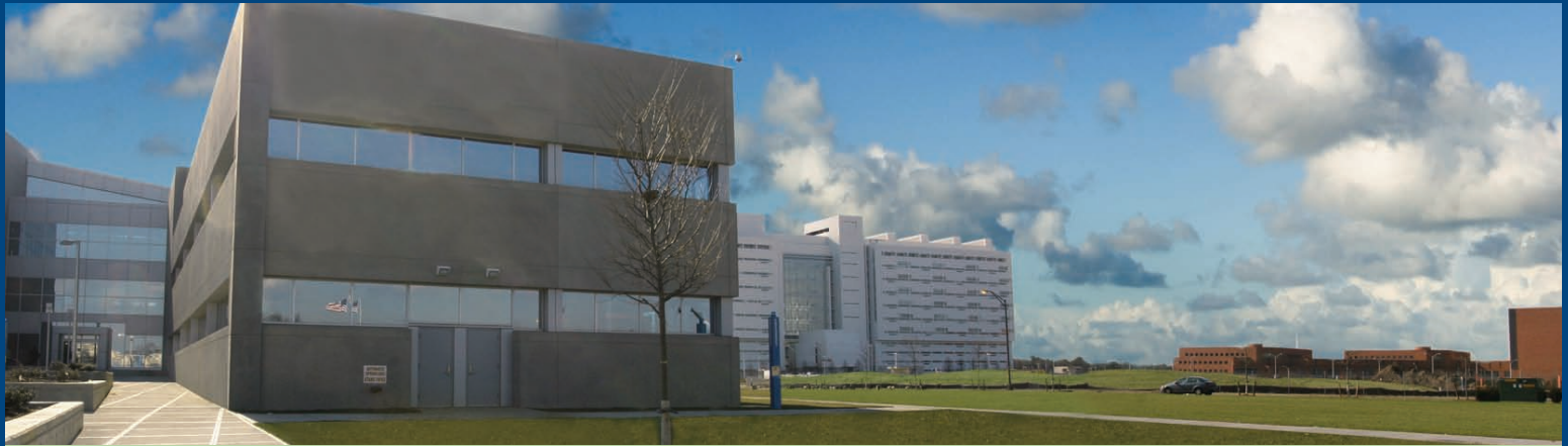
Touro Law Center, The Alfonse M. D'Amato U.S. Courthouse and The John P. Cohalan, Jr. State Courthouse.